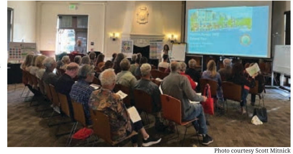
General Plan Workshop attendees listen to a presentation before breaking into interactive stations.

The Economic Vitality station focused on sustaining existing businesses while attracting new ones, adapting to workplace changes, maintaining fiscal health, and working collaboratively with SMC. Visitors to this station were asked to place post-it notes on an aerial-view map of one of the town's shopping centers with comments specific to improvements they would like to see implemented. At the Sustainability and Resilience station, it was noted that Moraga's existing Plan was prepared before climate change and sustainability were crucial issues.